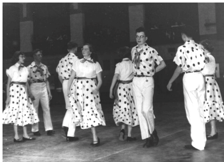
The Polka Dots from Dennis, MA. 1954 NEFFA Festival

Mansfield High and Middle Schools, Mansfield, Mass.