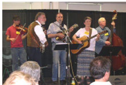
of Shoregrass Bluegrass